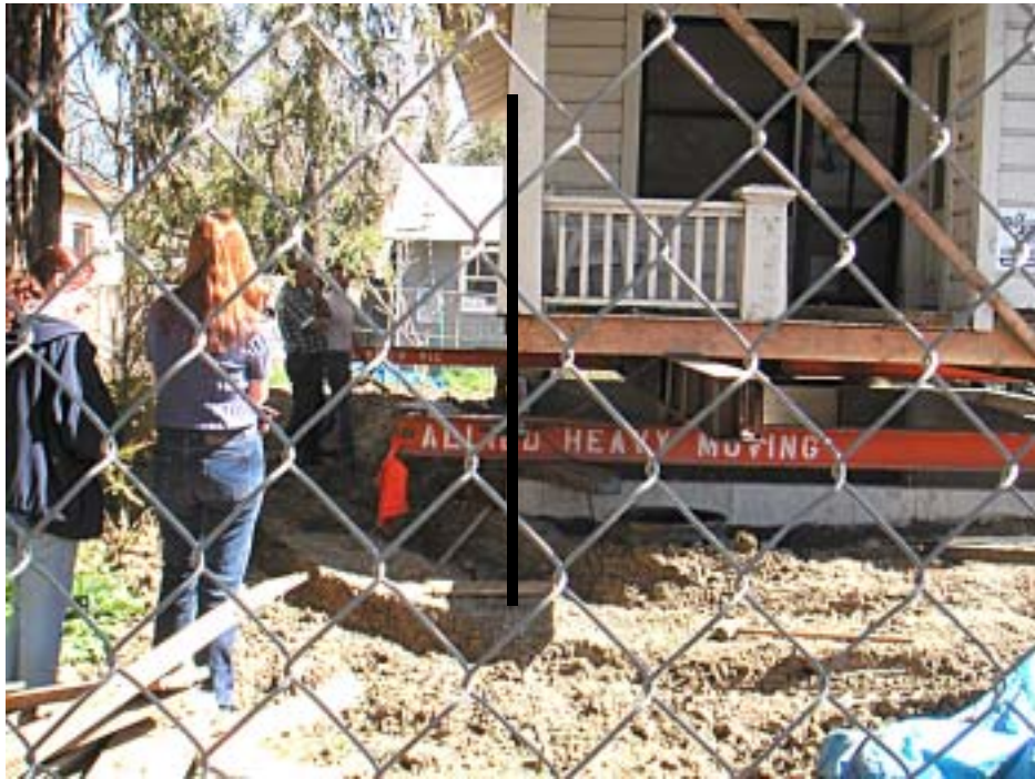
# 11. At last, the building is over its new foundation, marked by the black line drawn on the picture to show the edge of the house over the edge of the foundation. From here, it was simply a matter of using hydraulic jacks to stabilize the house in place.