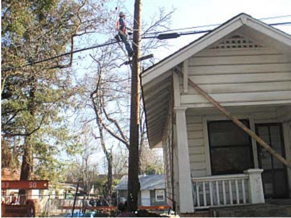
# 7. Getting the house onto the 516 D lot was delicate because the space between the electric pole on the left and the tree and house on the right only provided a few inches of clearance. Here we see the house clearing the pole on the left.