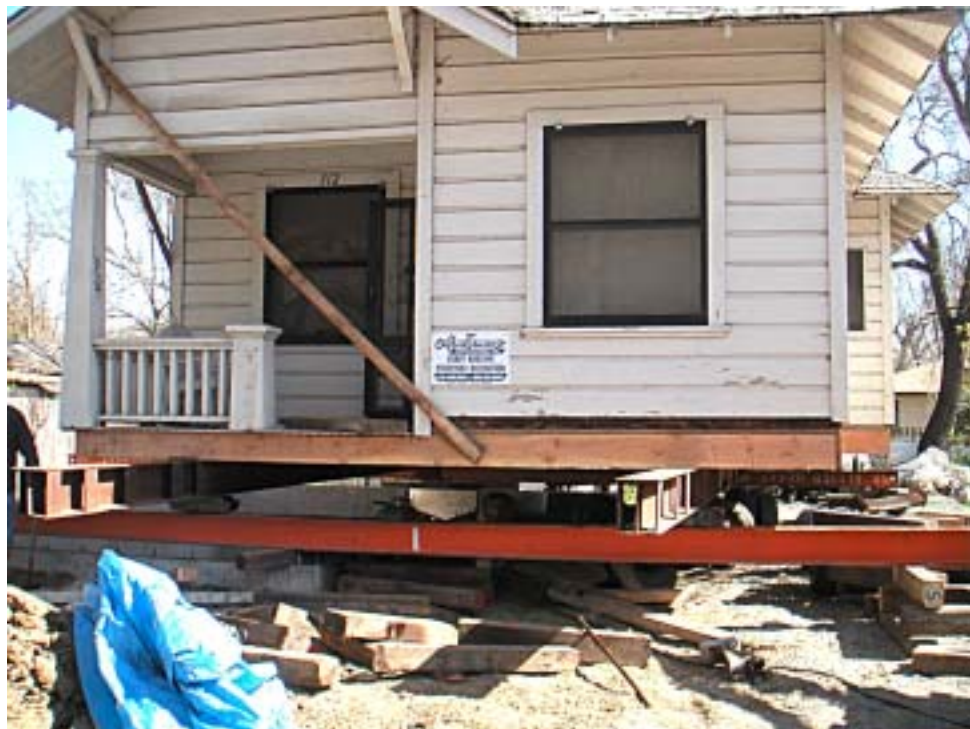
# 10. Using a ratchet pulley operated by hand, the house is pulled on rollers to the left and over its new foundation. Here it is about one-quarter of the way over the foundation.