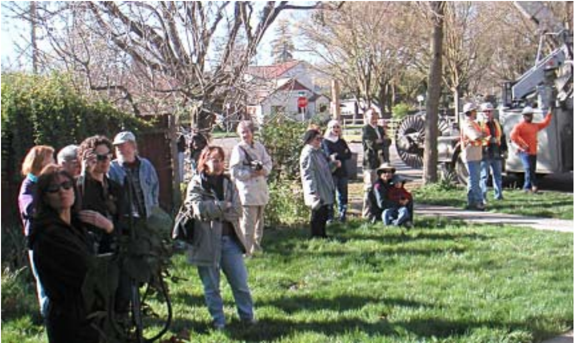
# 6. View of a portion of the several dozen people assembled to watch the delicate process of placing the building on the 516 D lot.