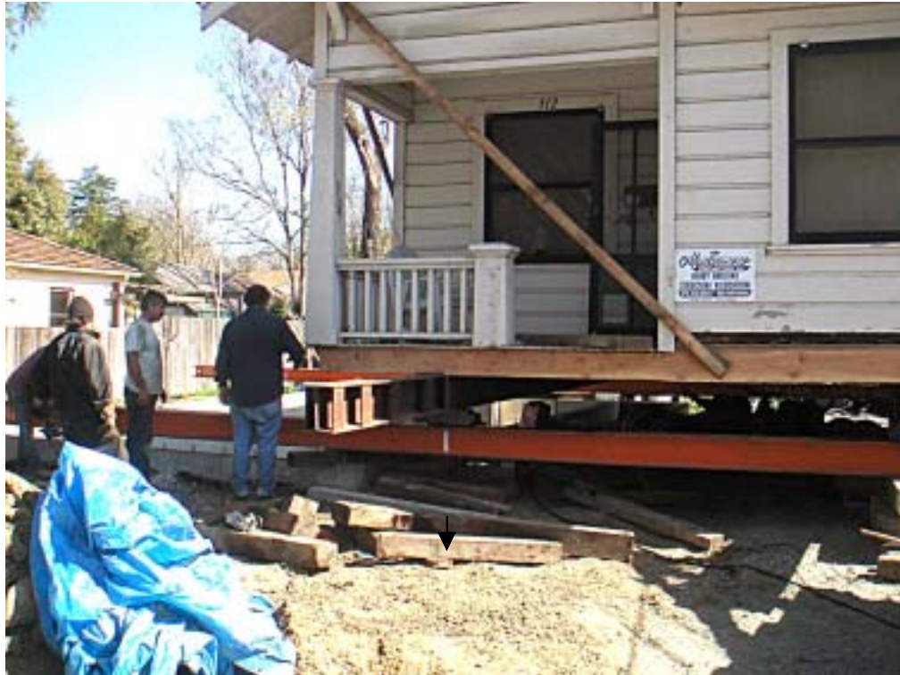
# 9. The building is brought along side the foundation built at 516 D and rested on two I beams on which it will be pulled over the foundation. Here, the building is beside its new foundation, which is to the left.