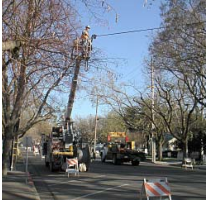
# 3. The moving required coordination of several agencies, including PG&E shown here raising wires. Others agencies included City of Davis tree crews, who pruned trees for clearance as the building moved, SBC moving telephone wires, and the Davis Police directing traffic.