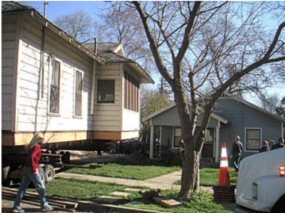
# 8. On the right, it barely clears the house at 512 D.