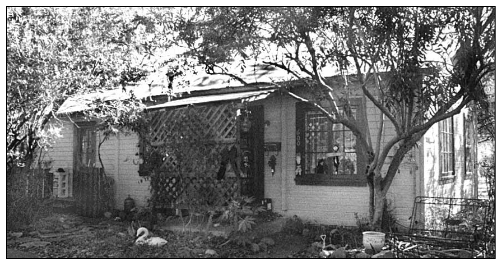
Mid-1990s photo of 600 6th

Copy of a photo used in a USPO advertisement appearing in the Enterprise's Those Who Make Memories