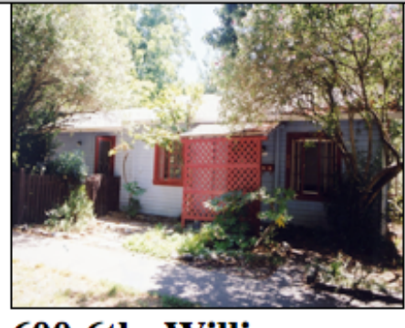
600 6th, Williams-Smalley Home

Built 1932-3, termed by experts "a very simple concept, almost vernacular."